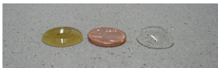
Protected with COLORTEC® Max , left oil, right water

Videos with "repelling" effects of COLORTEC® can be found in our online video gallery .